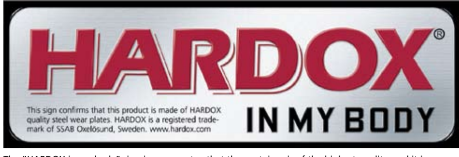
The "HARDOX in my body" sign is a guarantee that the container is of the highest quality, and it increases the resale value of the container.

HARDOX wear steel combines toughness with high hardness. In a container, this means higher resistance to blows and dents than that offered by other steels, and also a higher wear resistance.